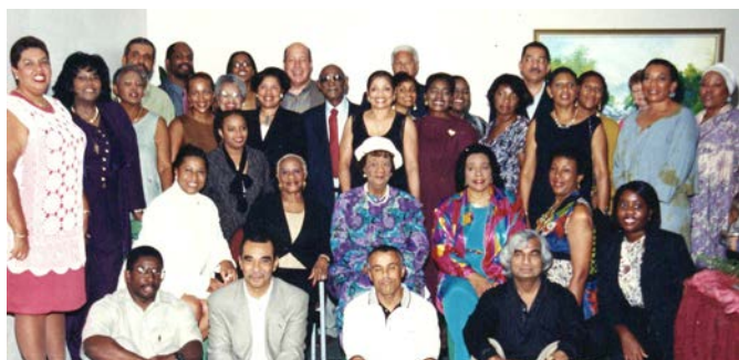
African American Leadership Family during a Leadership Retreat in Jamaica.