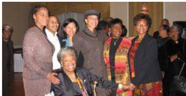
African American Leadership Family Members with the late Dr. Maya Angelou (seated).