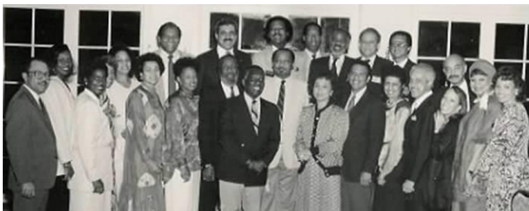
Early African American Leadership Family Retreat hosted by Arthur Ashe in Florida.

BEGINNINGS | Since 1985, a cadre of accomplished African American leaders called “ The Leadership Family ” banded together to empower one another, leverage their diversity, and to achieve extraordinary heights of excellence for themselves, their organizations, and communities.