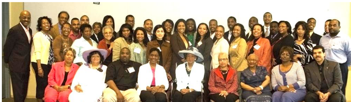
MSDL Faculty Team and MSDL I Fellows with Leadership Family members during 2008 inaugural session hosted at Microsoft.